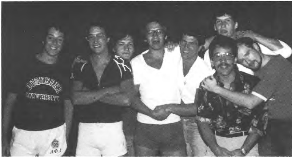
UNDERGRADUATES FROM PSI & BETA BETA CHAPTERS (DUQUESNE UNIV. & MANHATTAN COLLEGE)