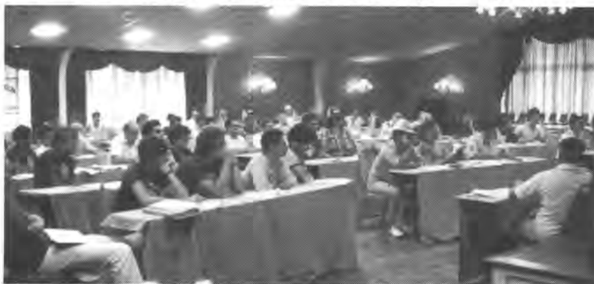
NATIONAL COUNCIL DELEGATES IN SESSION

Coming off a year of unprecedented initiation and revenue, the National Council has voted to support the work of its Executive Council and take bold new steps into the future. The 59th National Convention at the Downingtown Inn in Pennsylvania will long be remembered as the time Alpha Phi Delta "put its money where its mouth is" and began implementing vital national services for its undergraduates. Represented were sixteen chapters and thirteen alumni clubs, although total attendance barely reached the two hundred mark. Among the most important issues that confronted the National Council were plans to institute a paid Chapter Consultant at the start of the 1980-81 school year, funding proposals to establish the corporate tax structure of the National Fraternity and plans to re-district Alpha Phi Delta.