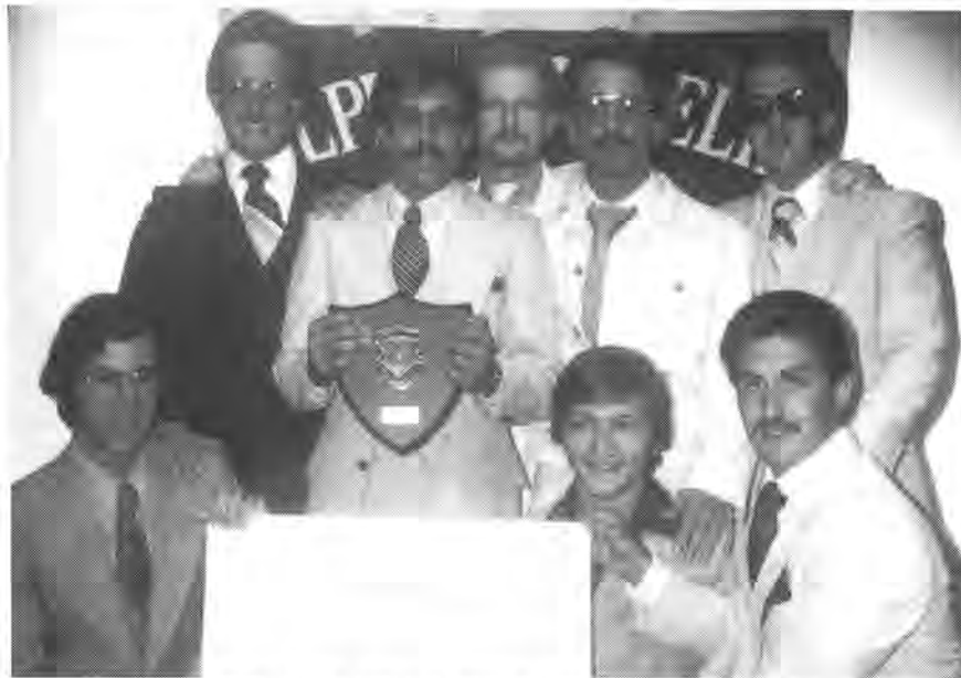
BETA BETA BOYS DISPLAY THEIR NEW CHARTER REPLICA.