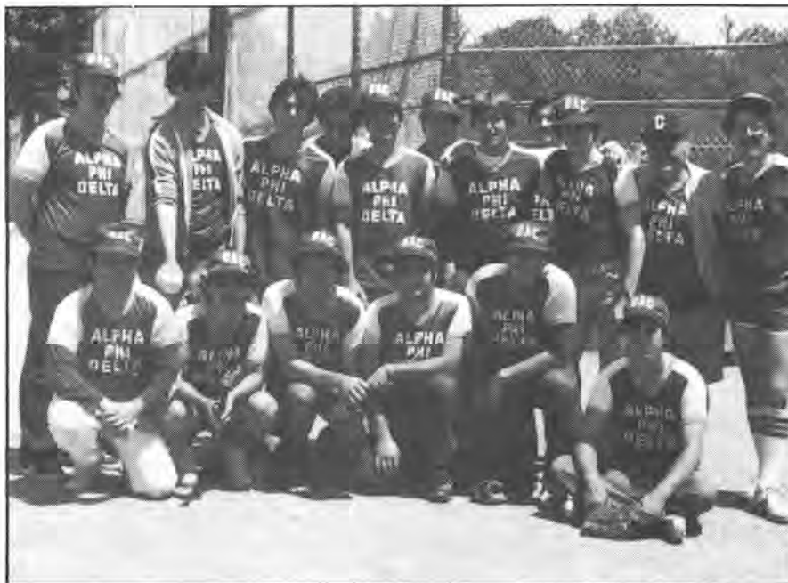
The Brooklyn A.C. gathers for a spring training session representing APD in the Staten Island Softball League during the summer months.

Contribute to the Alpha Phi Delta Scholarship Foundation in their name.