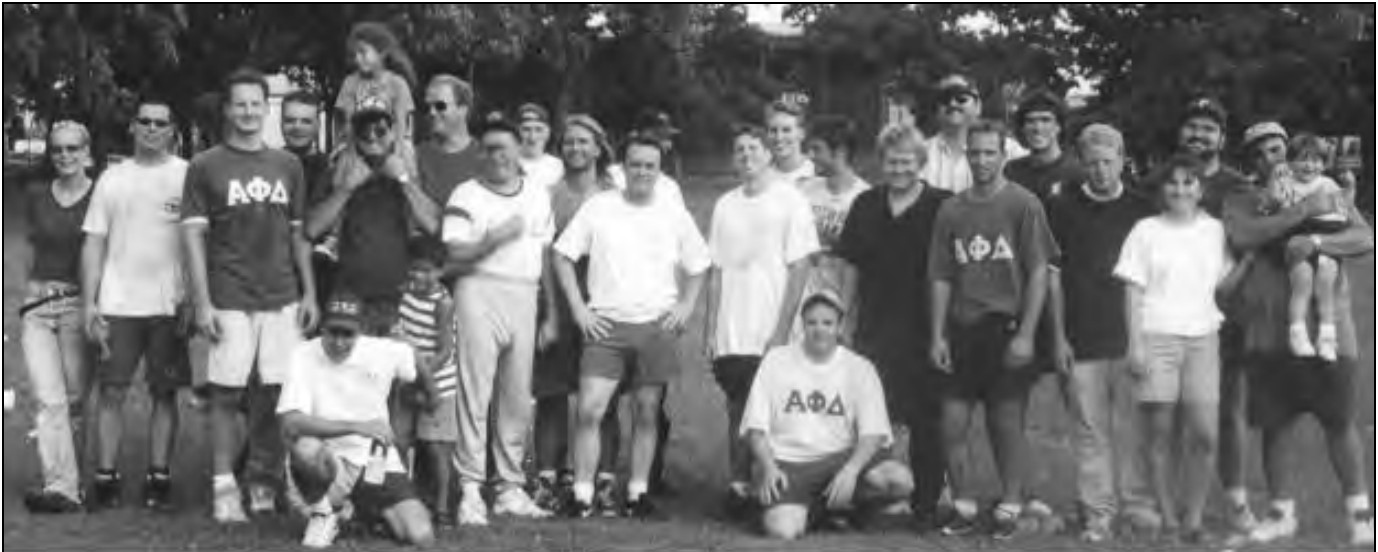
September 20, 1998 - aftermath gathering from the annual fall football game between the NJAC and the undergrads from Beta Xi.