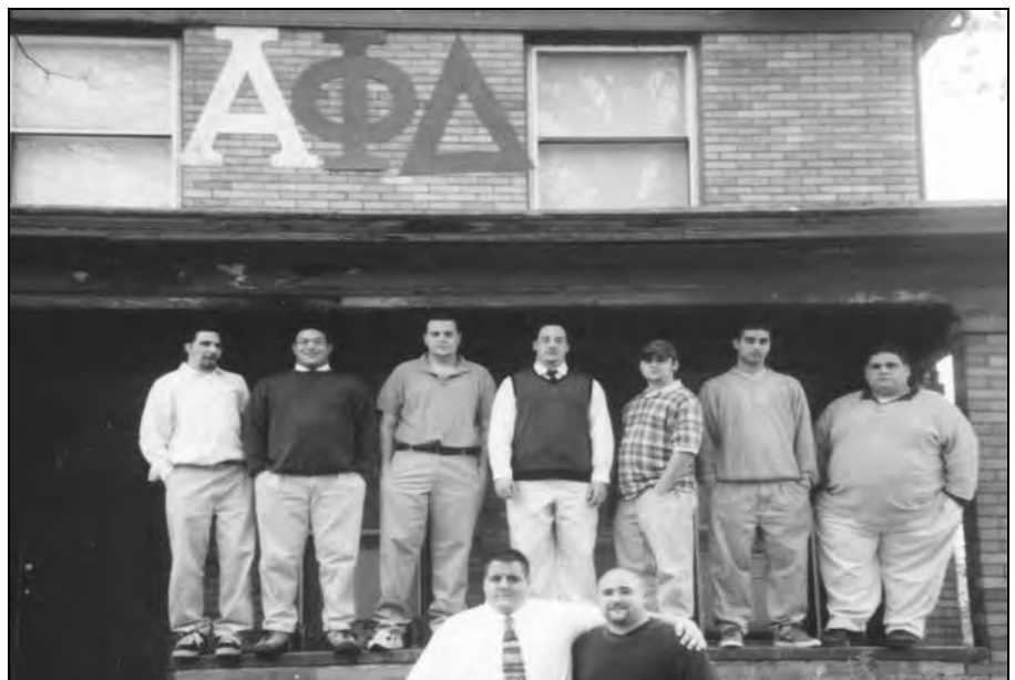
Beta Rho Chapter poses with their six newest brothers after initiation November 8, 1998. The brothers from Gannon University are on the porch of the chapter house showing off the letters in Erie, Pa.

In the 1980s, Alpha Phi Delta sold all properties. The Beta Lambda house was sold to the Beta Lambda Housing Board, comprised of several Beta Lambda alumni; and a loan was issued by the Alpha Phi Delta Foundation to the Housing Board. The house is still owned by the Beta Lambda Housing Board with Alpha Phi Delta Foundation owning a portion of the total note. It is too early to tell how much the insurance company will pay