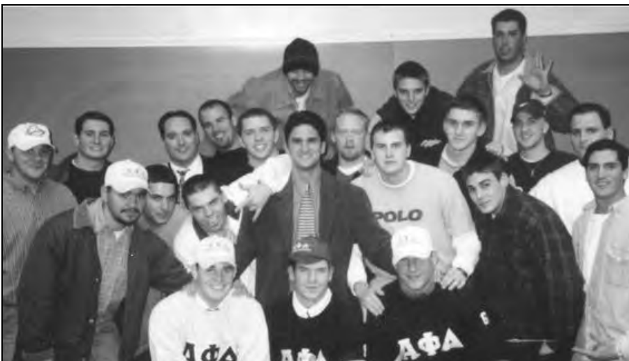
Brothers from Psi Chapter (Duquesne University) celebrate the initiation of three new brothers (front and center) November 5, 1998 (the anniversary of the national fraternity). The three new brothers bring the total chapter initiates to over 930 — the largest in the fraternity. The chapter is looking forward to celebrating its 70th anniversary in 1999.

Wonder how your chapter is doing? Not all of our chapters are still active. Some are inactive, permanently or temporarily. Here's a list of active chapters (first number after the parentheses is their membership total