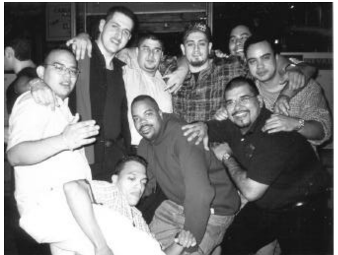
Brothers from Delta Epsilon Chapter pose for The Kleos