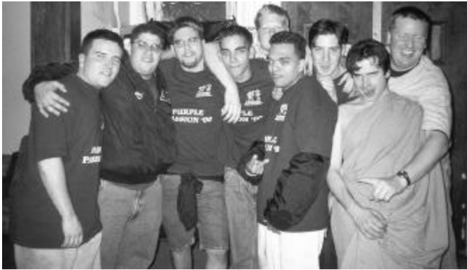
Alpha chapter brothers pose after a spring party.