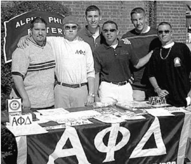
Beta Beta brothers participate in Rush Fair 2000.