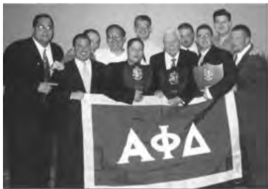
New York Alumni Club Outstanding Alumni Club