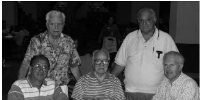
As usual, the Alumnus Emeritus Club met for lunch at the convention. Alumni Emeritus are those brothers who have celebrated 50 or more years in the fraternity. The fraternity treats them for the lunch at the summer convention.