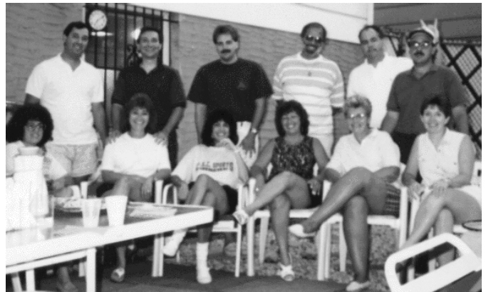
Brooklyn Alumni Club at a summer swim party with their spouses.