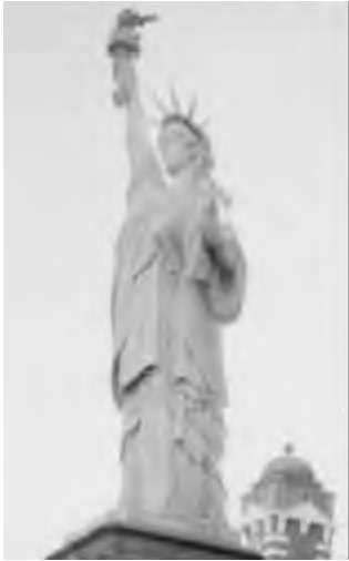
Is this New York City? No — just the Statue of Liberty replica at the New York New York Hotel.