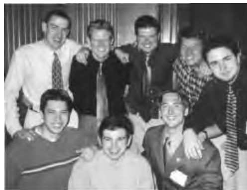
Delta Sigma, Tufts University Outstanding Chapter