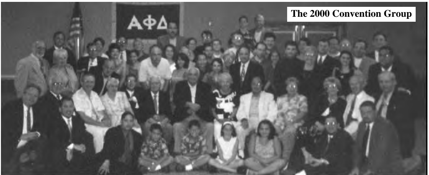
The 2000 Convention Group