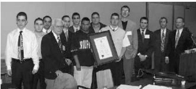
Delta is reactivated at the National Council meeting on March 31st and receives its charter back.