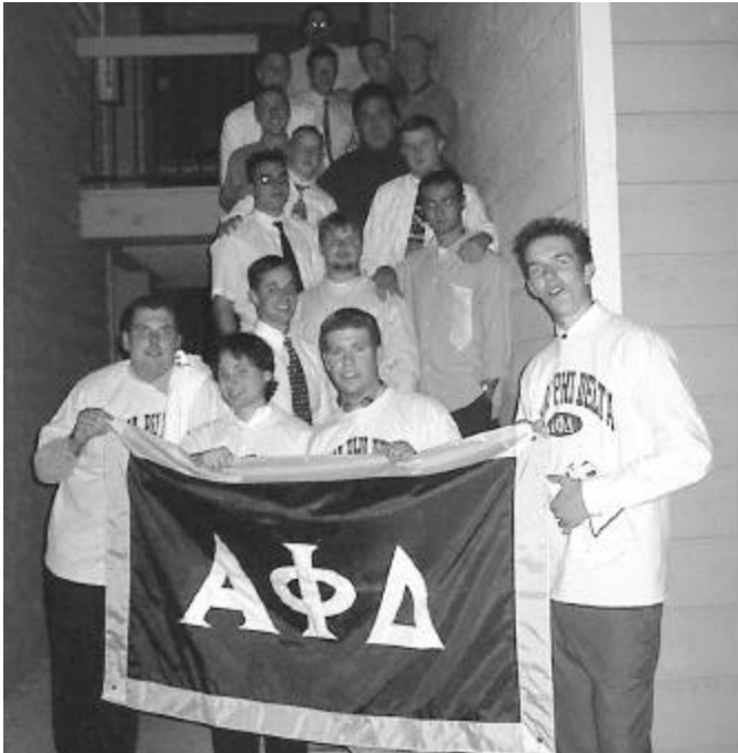
Delta Pi chapter celebrates after spring induction brings in four new brothers.