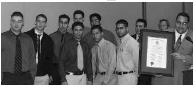
Gamma Omicron is reactivated at the National Council meeting on March 31st and receives its charter back.