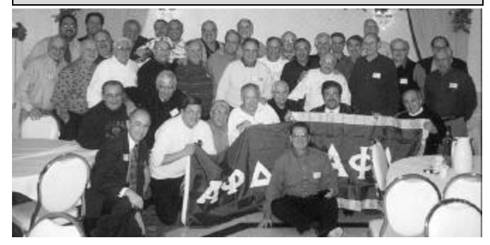
The Chicago Alumni Club celebrated Founders Day with their annual Thanksgiving Dinner in November.