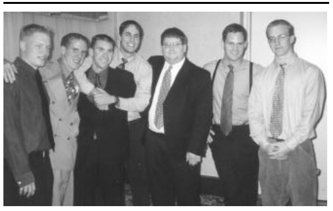
Psi Chapter brothers came out for a little dining and dancing at the Pittsburgh Alumni Club's annual Dinner Dance on November 11th.