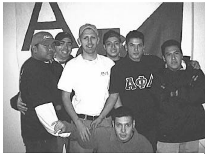
Our expansion colony at Kean University (Union, N.J.) celebrated an induction on December 2, 2000.