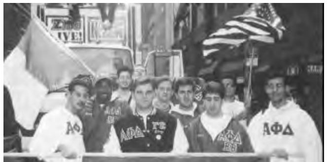
New York area brothers march in Columbus Day Parade, October 1992.

These pages are excerpted from the new fraternity publication, "The History of Alpha Phi Delta, 1914-2000" which is being published this spring. An order form to purchase the History book is on page 15.