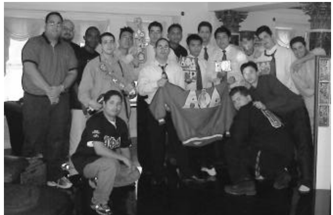
Gamma Rho held its fall induction on December 10, 2001. Five new brothers were initiated.