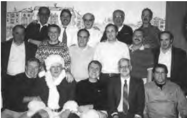
Pittsburgh Alumni Club executive committee enjoys its annual Christmas Dinner, December 1994.