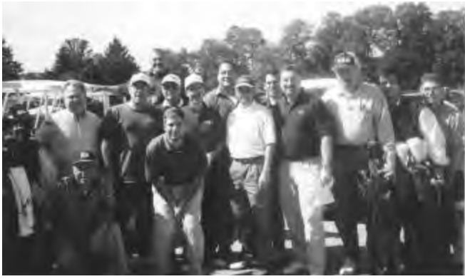
This group of brothers represented four alumni clubs (Pittsburgh, Delaware, Brooklyn and North Jersey) and various chapters. In October 1999, they participated in the first Alpha Phi Delta golf outing held outside of Philadelphia.