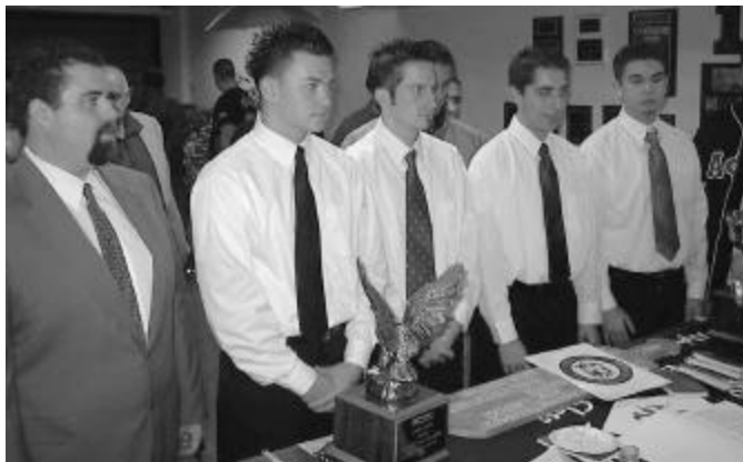
New brothers at Delta inducted December 1, 2001.