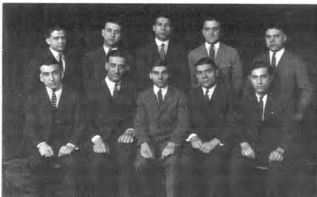
Kappa Chapter, Western Reserve University, Cleveland, Ohio, Founders, 1922.