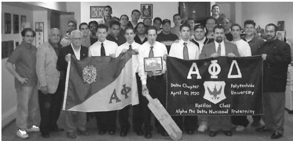
Brothers at the joint New York AC meeting / Delta Chapter induction on December 1, 2001.