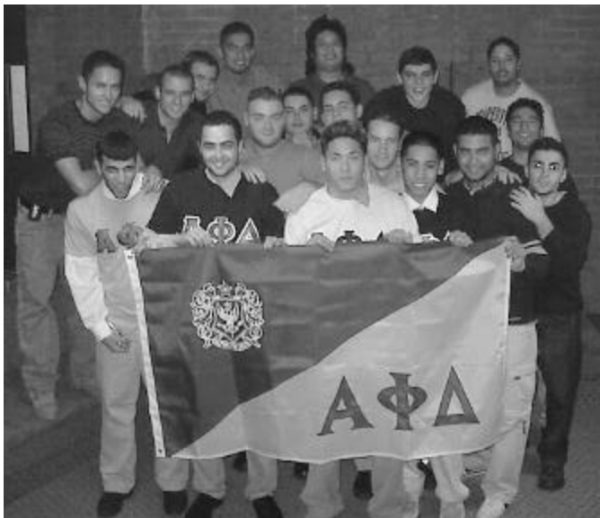
Gamma Omicron Chapter at SUNY Stony Brook in New York held an induction which took place on December 1st when four new brothers were initiated.