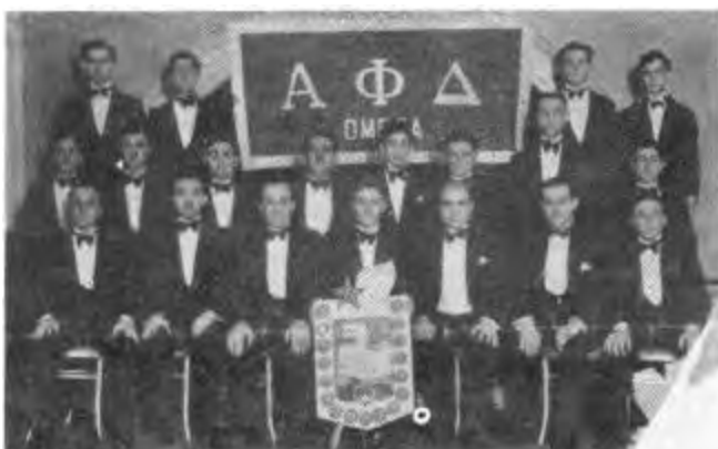
Omega Chapter, University of Rochester, Founders, 1929.