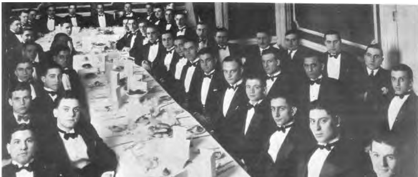
Sigma Chapter, Boston University, Installation Banquet, American House, Boston, Mass., February 21, 1927.