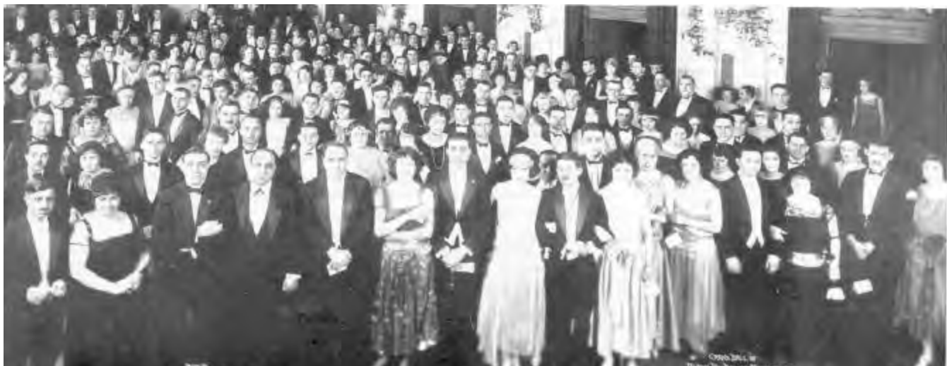
The Grand Ball: Fifth National Convention, held at the Hotel Biltmore, New York City, February 10-12, 1923.