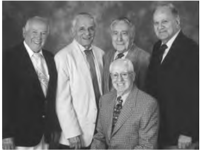
Brothers forever. The Eta pledge class of 1934 celebrated its 65th anniversary in 1999. Five of the six pledge brothers met for dinner (the sixth was unable to join). All six have remained friends and brothers since pledging.