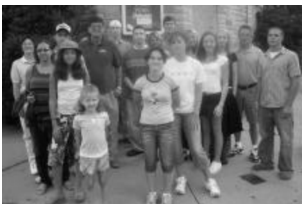
This fit-looking group decided to walk the mile-plus from the hotel to Little Italy for dinner Thursday night.