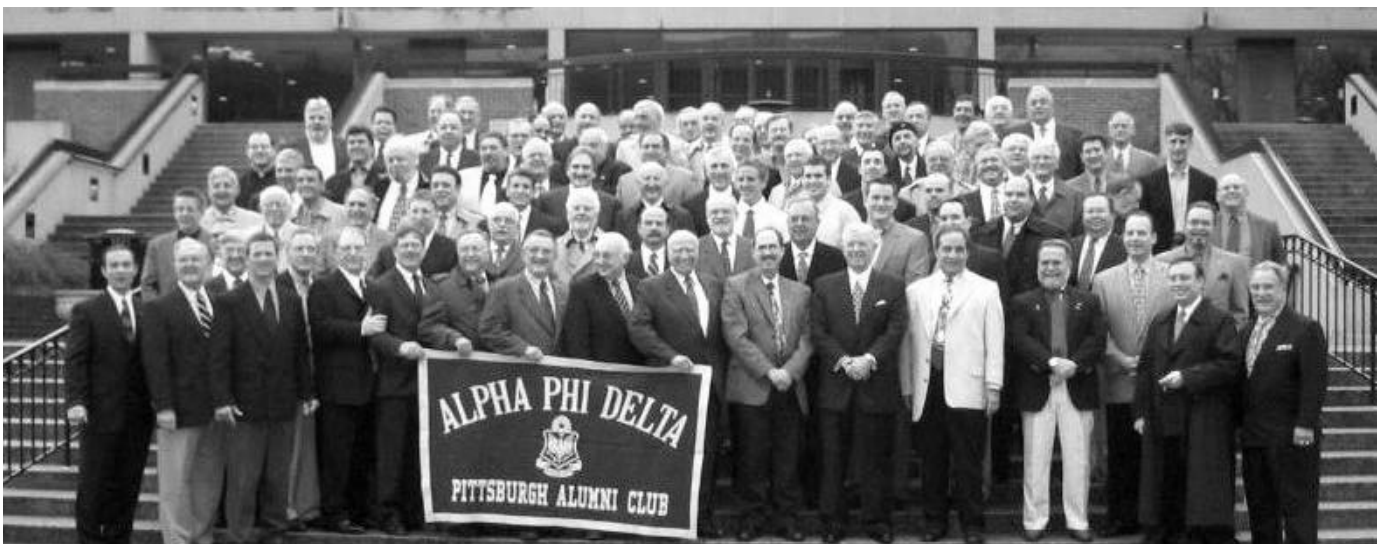
Psi Chapter celebrates a gala reunion anniversary at Duquesne University on March 20, 2004. 85 of the 126 attendees were able to fit into this group photo in front of the student union before the dinner.