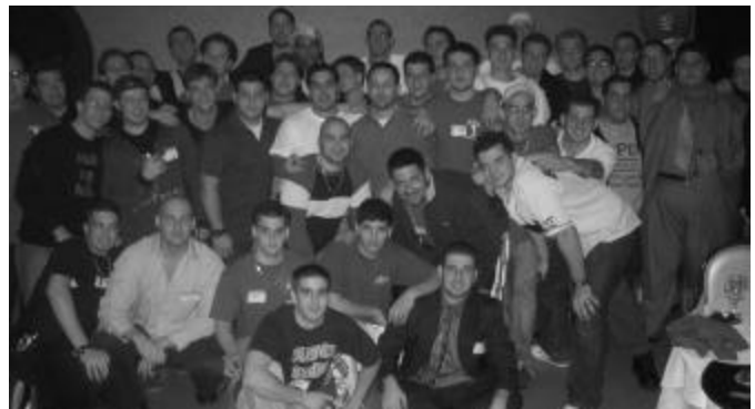
The New York contingent in Youngstown.

Youngstown as well. We drove back down to Florida and arrived early in the morning. I went off to class and when I returned, I felt compelled to call some of the individuals that I had met just to say hello; despite how tired I was. This event that you were responsible for, strengthened the bond within our organization."