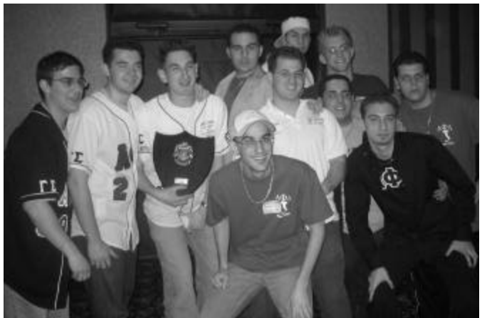
Gamma Sigma Chapter, St. John's Staten Island, shows off its award for Community Service.