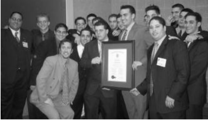
Gamma Sigma Chapter, St. John's University, Staten Island, was re-chartered.