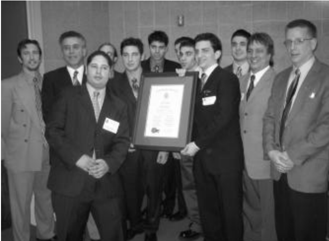
Beta Omicron Chapter at Youngstown, Ohio reactivated its charter with a new group of young men. They fittingly received this recognition in their hometown at the National Council meeting.