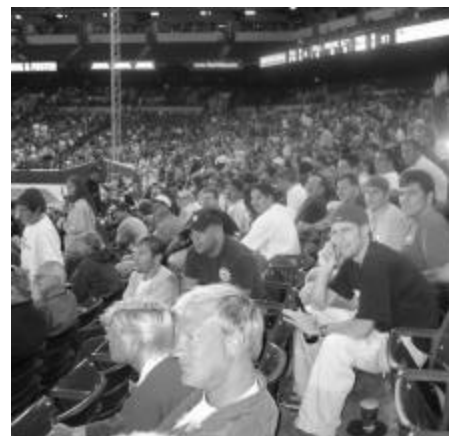
Part of the APD crowd of nearly 80 attending the Orioles game at Camden Yards.