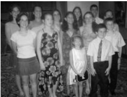
Families were in evidence at the 2004 convention. This group of children was still awake after the awards ceremony ended Saturday night. This was less than half of the children who attended at one of the larger family conventions in the past ten years.