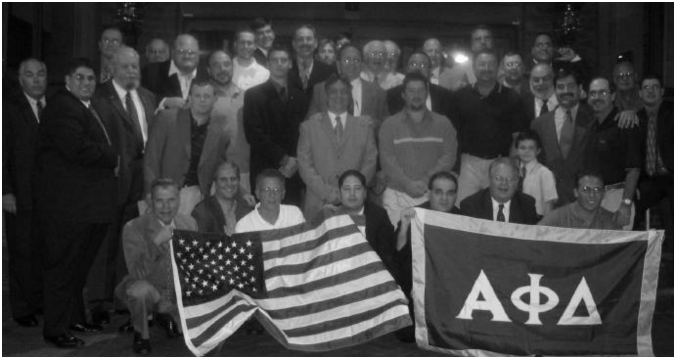
Brothers gather for a picture after the Awards Banquet August 7th.