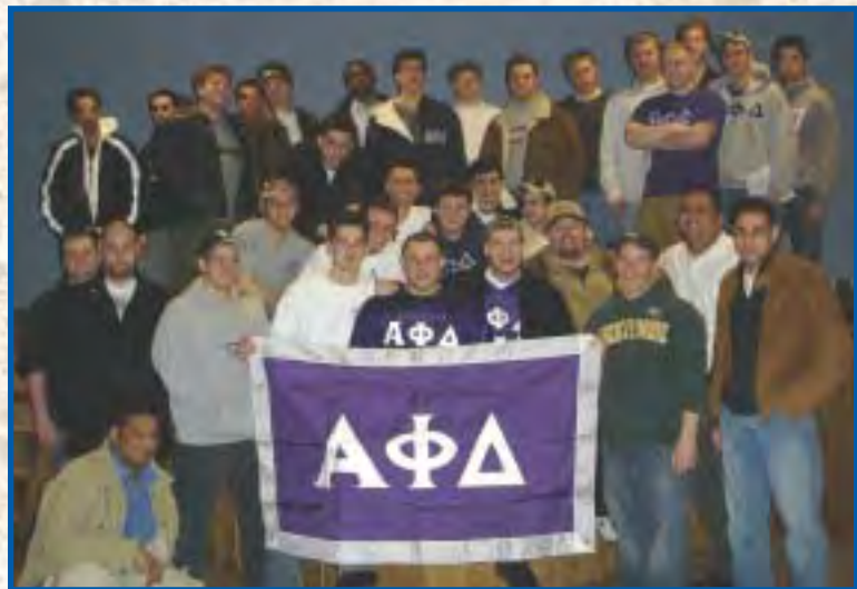
Brothers in attendance at the Eastern Pennsylvania Conference.