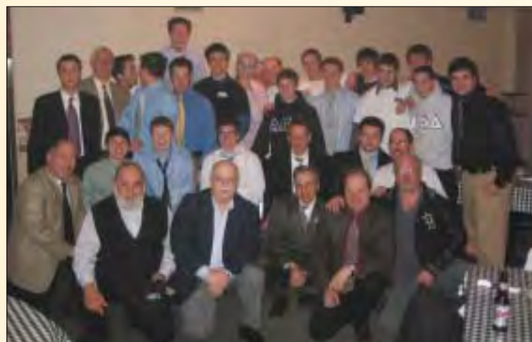
Psi Chapter and the Pittsburgh Alumni Club celebrate after a dinner inducting the 1,000th member of the chapter.