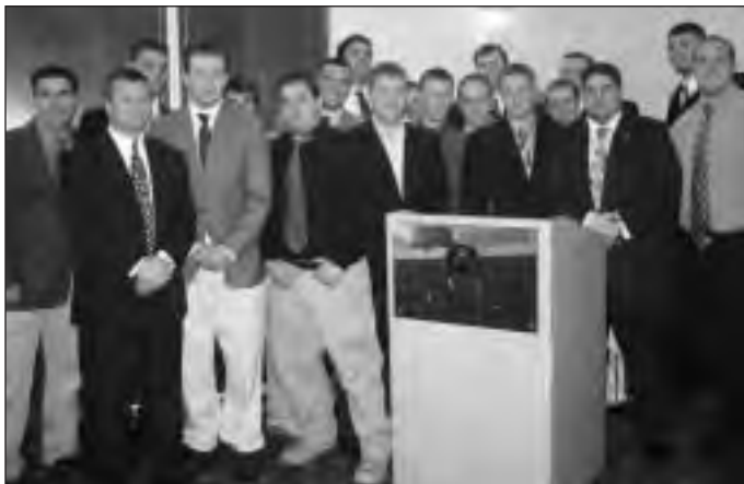
Delta Delta Chapter at Wesley College in Dover, Del. was reactivated on April 2nd with 27 brothers. Wesley is Delaware's oldest college and has 1200 undergraduates at the school. This chapter was deactivated in 1996 and has been rebuilding since 2002 with six pledge classes