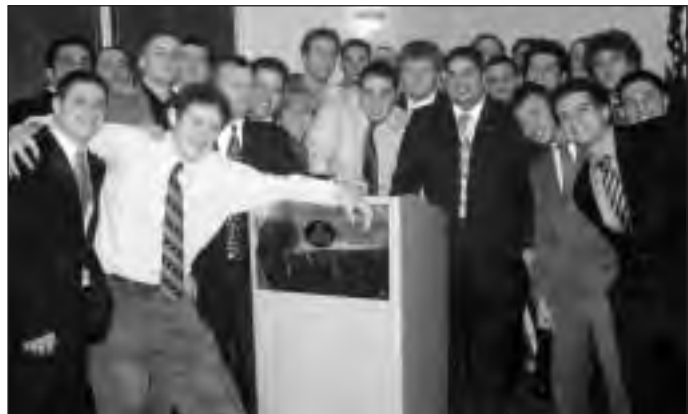
LaSalle University was chartered as our Epsilon Beta Chapter. The chapter has been a colony since 2002 and has 27 brothers. It has had five pledge classes and is very involved in charitable causes—Habitat for Humanity, Animal Shelter, Red Cross blood drives. It is the first Epsilon series chapter in the fraternity.