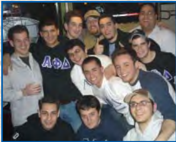
Brothers who attended the Eastern Pennsylvania Leadership Conference gather at a local restaurant.