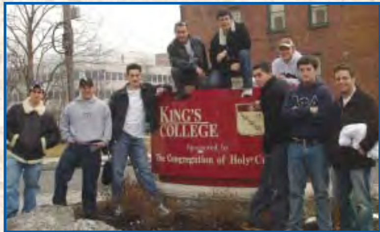
Brothers from Gamma Omicron and Gamma Sigma pose by a sign that welcomed the brothers to King's College.