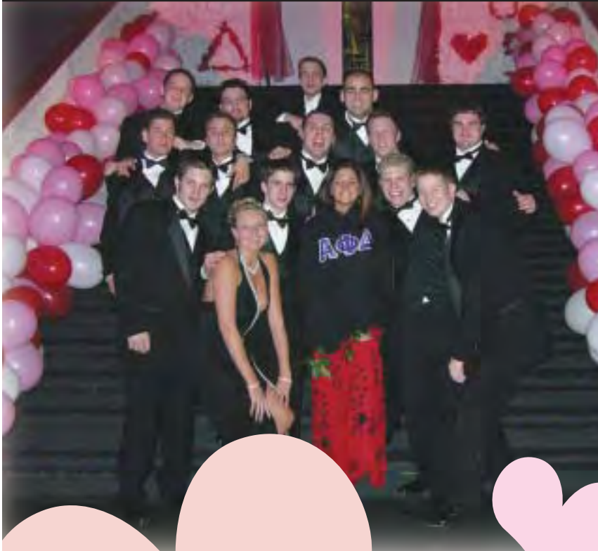
Psi Chapter celebrates the crowning of its new sweetheart in a presentation at the Valentine's Ball.