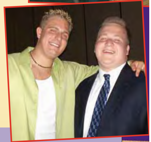
Brothers perform community service in fundraising event at Marist College. Delta Theta brothers and sisters of Sigma Sigma Sigma are seen above posing at the all night fundraiser, Relay For Life, which supports research for cancer. The co-sponsored team raised more than any Marist organization with over $8500.00.