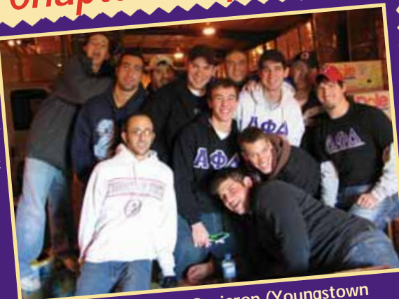
The brothers of Beta Omicron (Youngstown State) gathered this semester for a bit of philanthropy at the second harvest food bank in the city of Youngstown, Ohio.