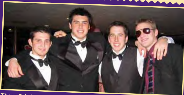
These Psi chapter brothers are dressed in their formal tuxedos as they hosted the 36th annual Valentine Ball at Duquesne University. In addition to hosting a dance, the brothers raised and donated $3500 to ALS (Lou Gehrig's Disease). They have raised $12,000 for ALS in the past four years.