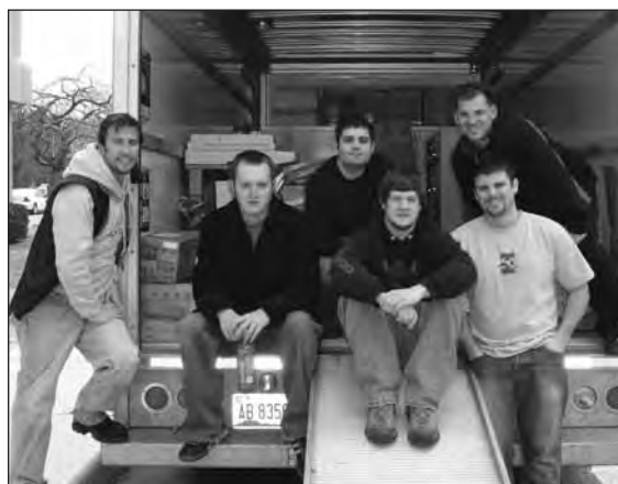
The brothers pose with the packed U-Haul in Indianapolis.