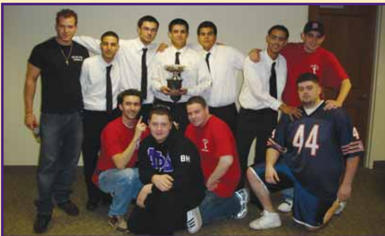
Beta Eta "67" narrowly defeated Gamma Sigma for the NYC District Pledgebowl crown. Initiations in New York City-Academic Year 05-06: Great Job to these chapters: Beta Eta-15, Gamma Rho-15, Gamma Sigma-14, Gamma Omicron-14, Beta Pi-12.