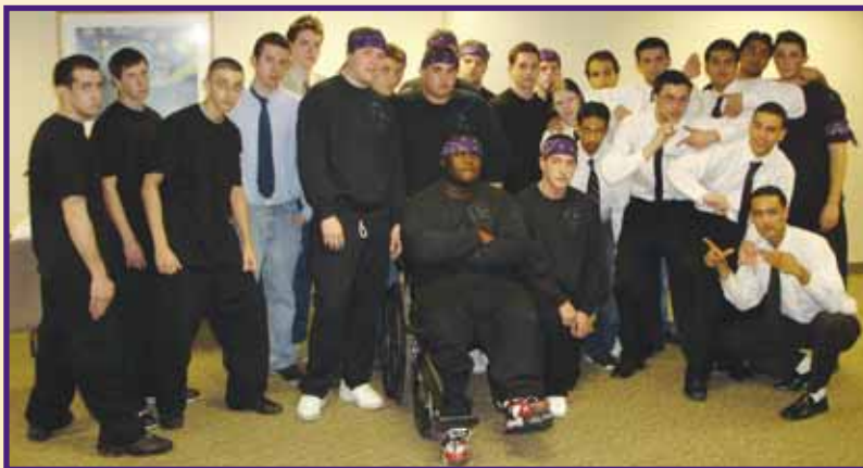
On Sunday, April 2, 2006, the NYC District held its Pledgebowl. Traditionally held each fall, this was the first time in many years that the district had enough of pledges to do one in the spring. Pictured are the Spring 2006 New York City District pledges.