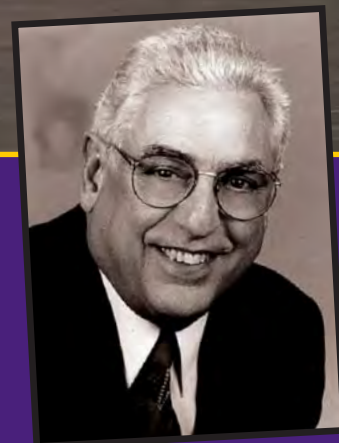
31st National President Zangrille passes away See page 14