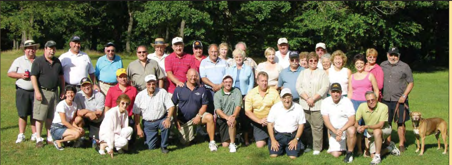
The Pittsburgh Alumni Club held its annual golf outing and family picnic on July 21st at North Park in Pittsburgh. Twenty brothers showed up for golf in the morning and were joined by spouses and non-golfers in the afternoon for a family picnic.