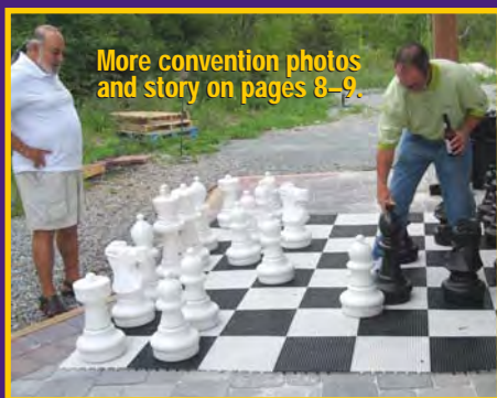
More convention photos and story on pages 8-9.