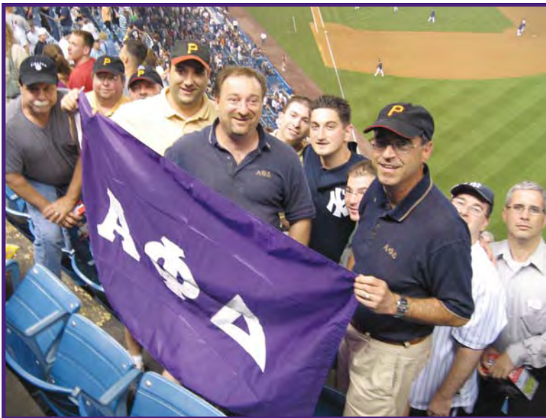
Brothers from the Brooklyn Alumni Club joined with the brothers from Pittsburgh in the upper deck of Yankee Stadium to watch the Pirates lose to the Yankees.