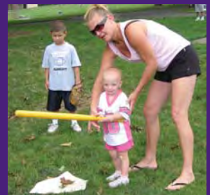
More convention photos capturing family fun in Lancaster.