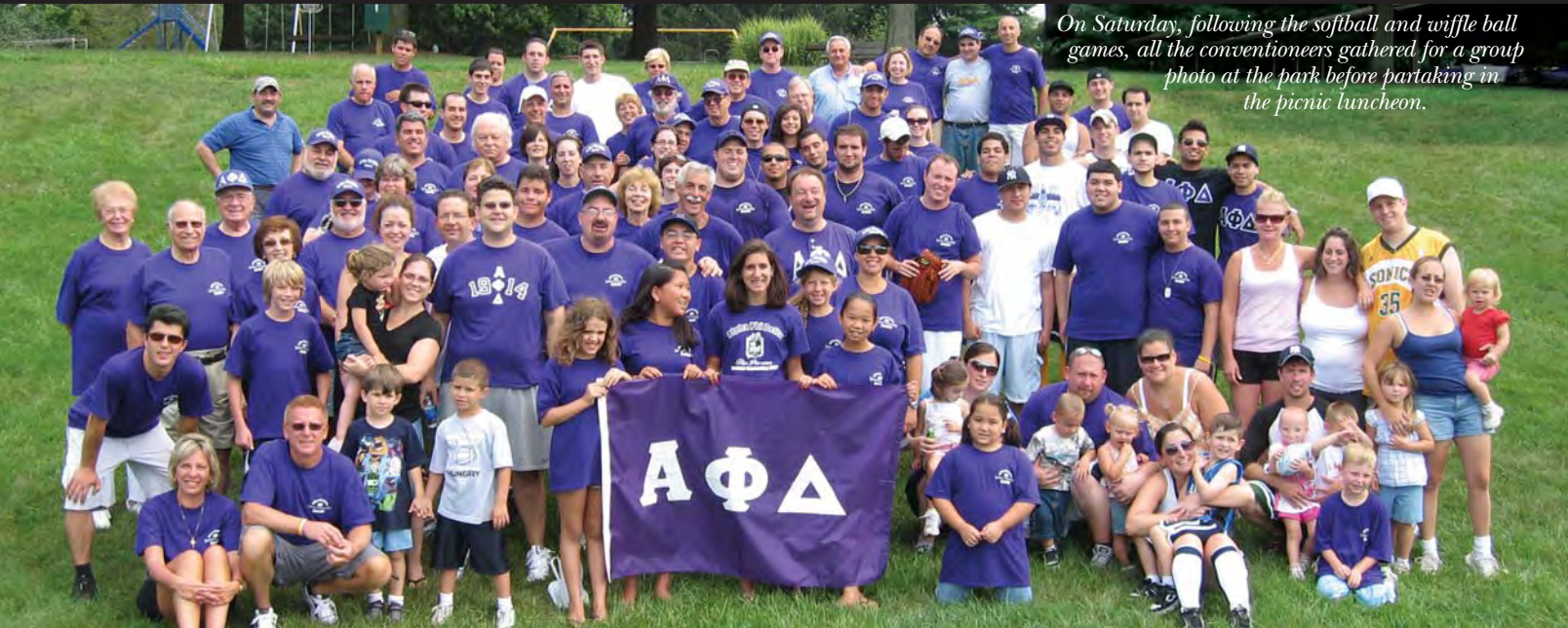
On Saturday, following the softball and wiffle ball games, all the conventioners gathered for a group photo at the park before partaking in the picnic luncheon.