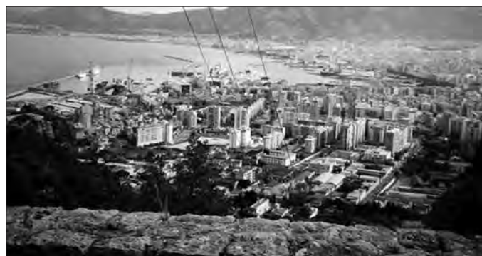
Panorama of Palermo, the Old City and harbor.

I spent the next several days exploring and re-acquainting myself with this old city. Back in '67, I knew every street in this city like the back of my hand. I re-visited the Quattro Canti, the four corners district in the heart of the old city; La Kalsa, the medieval Arabic district of Palermo; the Albergheria district, with its winding alleyways and thousand year old churches on each corner and the old open air market at Vucciria with the stalls lined with freshly caught fish, recently slaughtered chickens and lamb gutted and hanging from hooks. Amidst this cacophony of sights and smells were the cries of the merchants in bloodied aprons shouting out to the passersby to come inspect their freshly killed stock. You can find almost anything