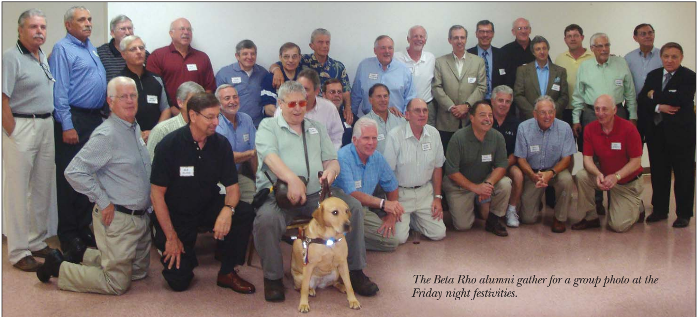
The Beta Rho alumni gather for a group photo at the Friday night festivities.