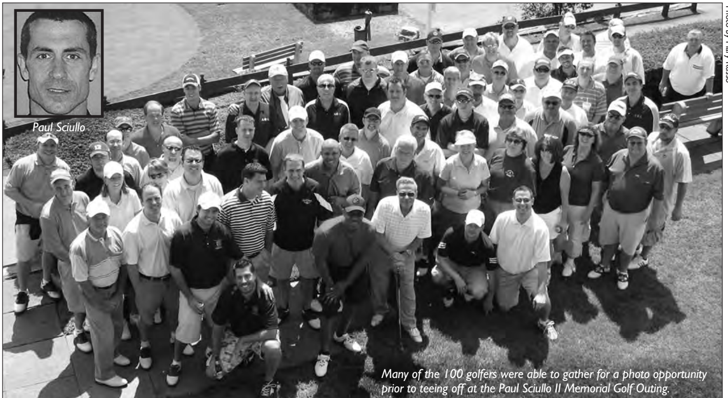
Many of the 100 golfers were able to gather for a photo opportunity prior to teeing off at the Paul Sciullo II Memorial Golf Outing.