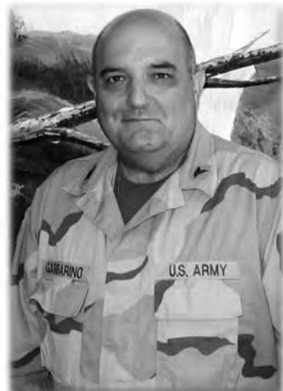
Col. Charles Garbarino

The book is available online at www.bn.com , www.amazon.com and soon through Barnes & Noble Booksellers.