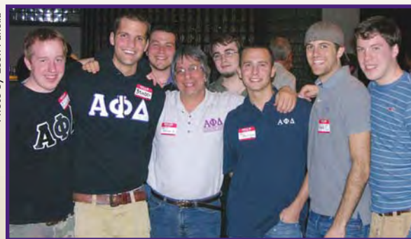
Pictured are several of the many brothers who enjoyed bocce night which kicked off the National Council weekend.