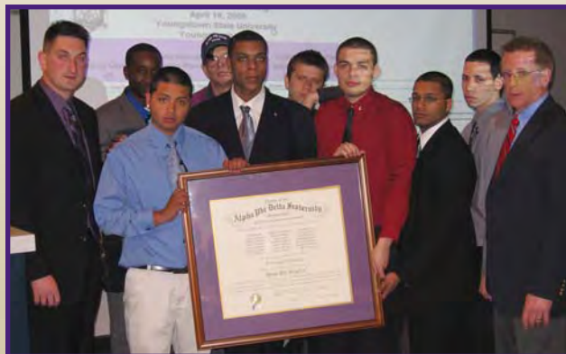
Delta Omicron Chapter of Rutgers, Newark, receives its charter back at the council meeting after 12 years.

This page is sponsored by The New York Alumni Club through a generous donation to the Foundation.