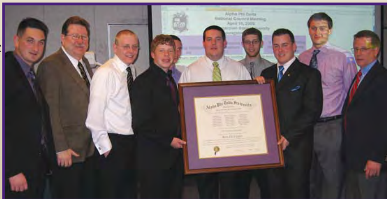
Beta Lambda Chapter of St. Francis of Loretto is reactivated at the council meeting.