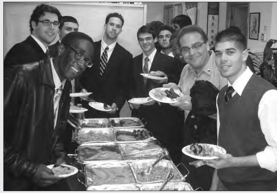
Brothers enjoy the Brotherhood for Life seminar.