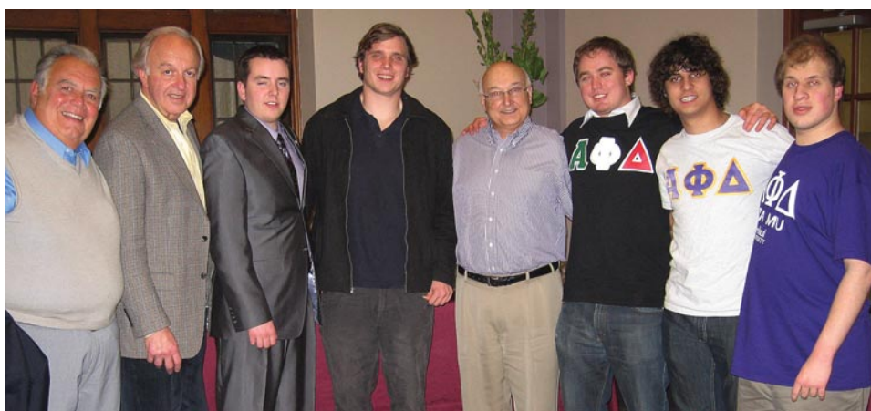
Over 100 brothers attended the council dinner. Pictured above are a variety of the attendees: alumni and undergrads from Chicago, Colorado and New York.