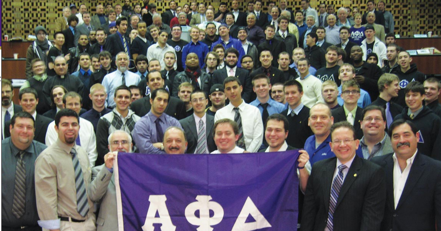
Over 140 brothers were at the council meeting. This picture was taken on the council floor at Zurn Hall on Gannon's campus.