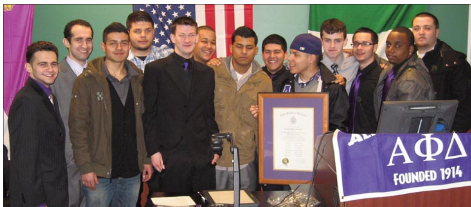
Delta Epsilon Chapter at John Jay University was reactivated at the council meeting. The chapter had a large contingency of brothers on hand to accept its charter.